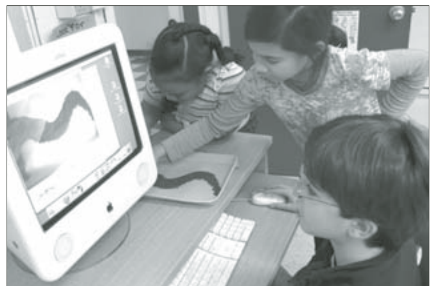
A group of fourth graders working in the media lab on their animated films for their river-cutters curriculum.

The students were very aware that the changes they observed in their river models offered proof of the ways that rivers change over