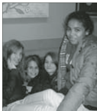
The Lower East Side of New York has been called a "Gateway to America" because of the millions of immigrants who made their first homes there. Photo at left, the facade of the Tenement Museum, home to an estimated 7,000 people from more than 20 nations between 1863 and 1935; at right, the intersection of Orchard and Delancey Streets; and above, right, 8th graders enjoying an after-tour visit to Starbucks.