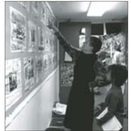
Parents and children looking at Peach Village (top) and the drawings first graders completed using photos they took on neighborhood walks (above).